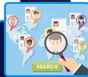
Job Search Strategy