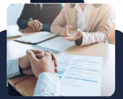
Interview Prep Guidance