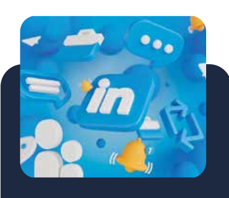
Create an All-Star LinkedIn Profile