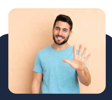
5 Mock Interview with Mock My Interview.Al